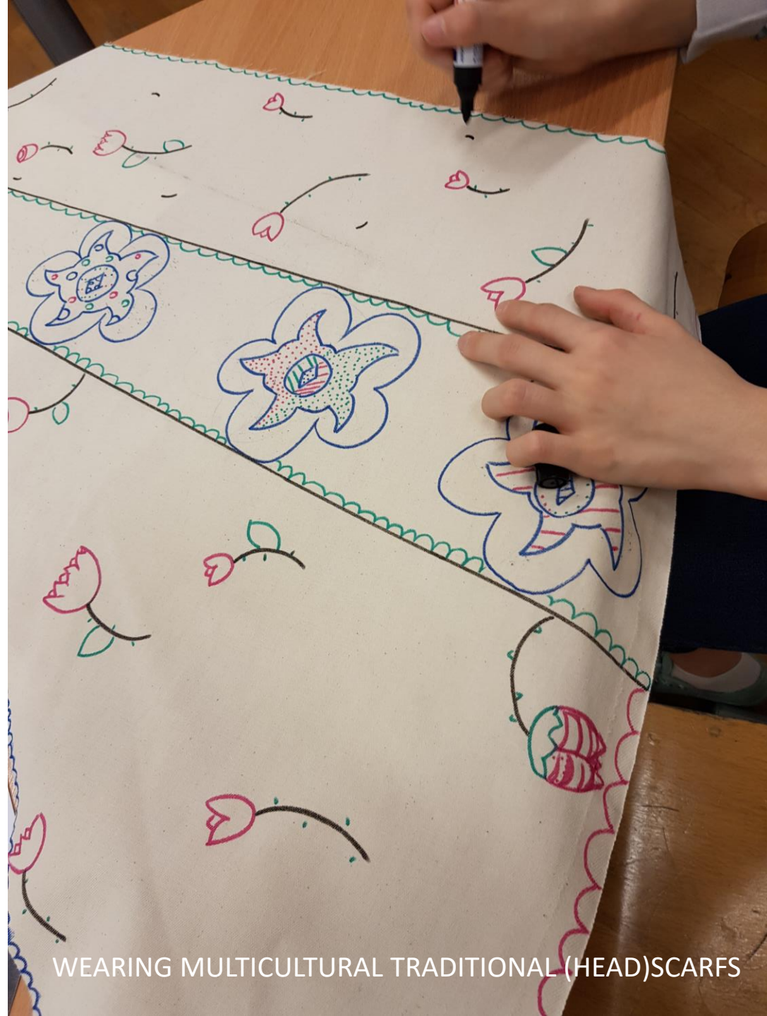
WEARING MULTICULTURAL TRADITIONAL (HEAD)SCARFS